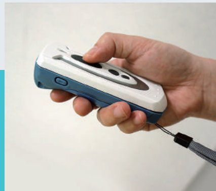
Ergonomic Outer Shell

Cino Bluetooth pocket scanner's holding grip matches the contour of worker's hand and its scan angle is specially designed to meet human factors engineering. The ergonomic design will minimize worker's fatigue, allowing extended use for scan intensive operation.