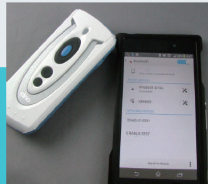
Bluetooth v 4.0 Technology

Cino Bluetooth pocket scanner adopts Bluetooth v4.0, the latest Bluetooth wireless technology. It's completely backward compatible with previous Bluetooth versions and can be integrated with most of Bluetooth host devices seamlessly. Moreover, it comes with more enhancements, such as faster pairing speed, lower power consumption, higher transfer reliability, and less wireless interference.