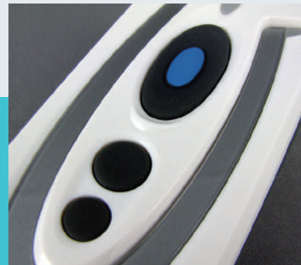
User-friendly Function Keys