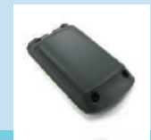
Battery Cover: 1150mAh 2300mAh