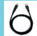
Cable: USB PS/2 RS232 Micro USB