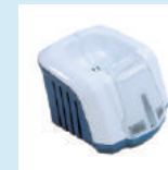
Smart Cradle Charging Cradle