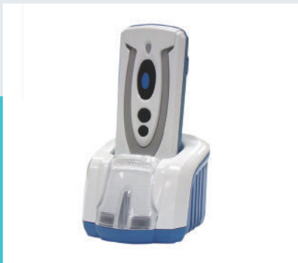
Smart Cradle Solution

Built with the advanced FuzzyScan 3.0 imaging technology, Cino Bluetooth pocket scanner is capable of reading most popular 1D, Linear-stacked, PDF417, GS1 DataBar and Composite barcodes. It can read 13 mil UPC/EAN barcode up to 24" as well as 3 mil high density barcode.