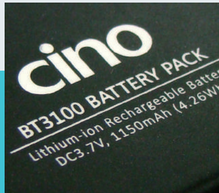
Efficient Power Management