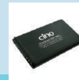
Battery: 1150mAh 2300mAh