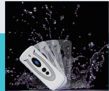
Rugged and Durable