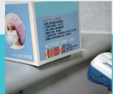
FuzzyScan 3.0 Technology