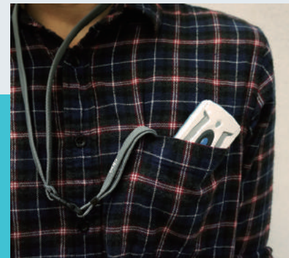
Compact Form Factor