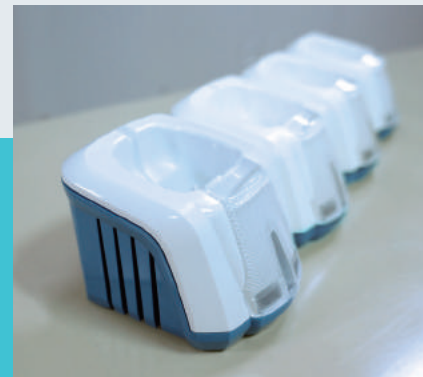
Multi-slot Cradle Solution